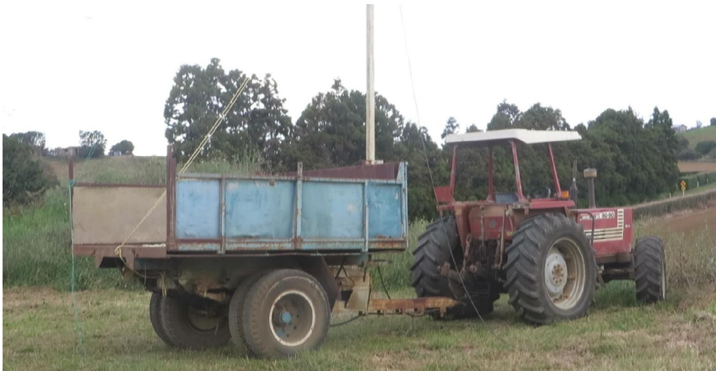
Above: The 40 m dipole was attached to the top of this pole

The pictures below show some of the features of the station and the activity going on.